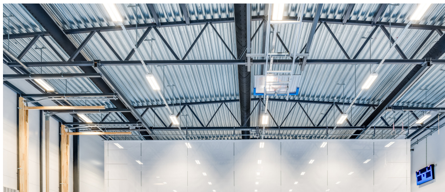
Figure 4 - Main arena columns and roof trusses

For the main arena, each truss spans 52 m between columns and is approximately 4 m deep at the midspan. The spacing of the trusses is between 7 m and 9 m. The columns are tall enough to provide at least 15 m of clear headroom in the arena. All the steel sections for the trusses, columns