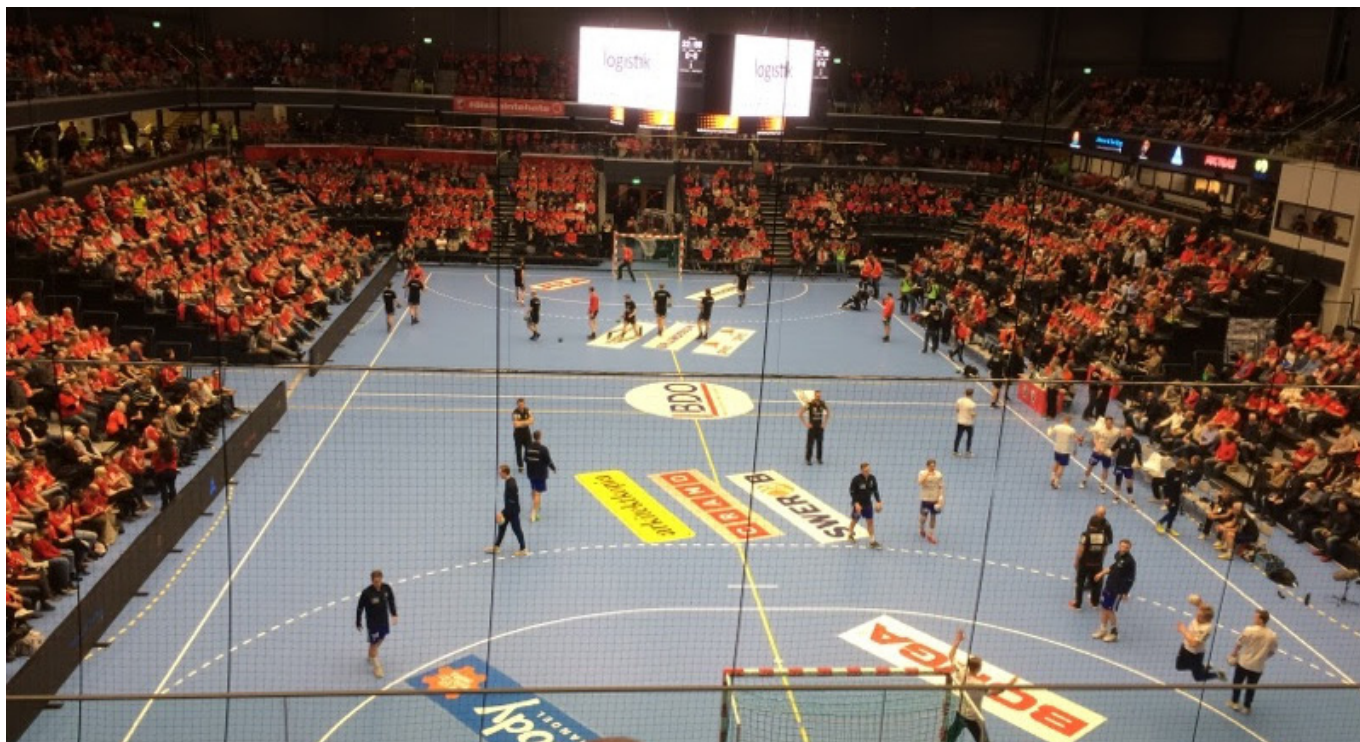
Figure 6 - A handball match in the main arena