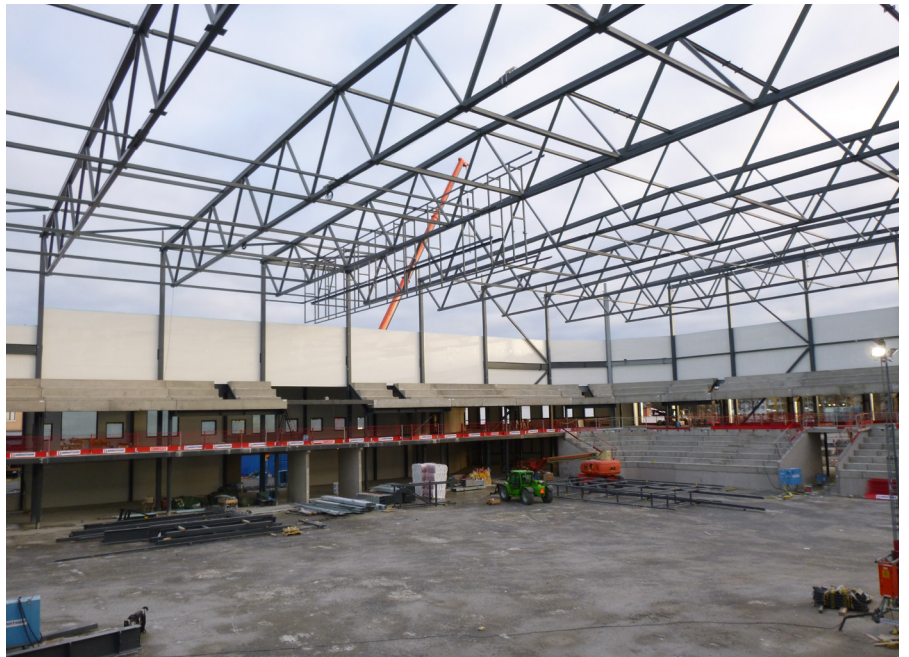
Figure 5 - Main arena roof trusses spanning 52 m being installed

To compensate for deflections arising from the self-weight of the trusses, the truss chords were fabricated with a pre-camber, hence once in-place, any member sag was not visible.