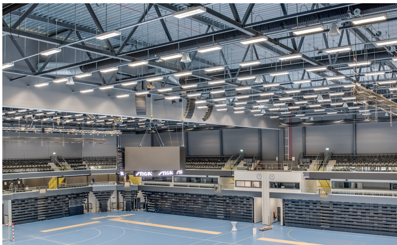
Figure 3 - Main arena roof trusses