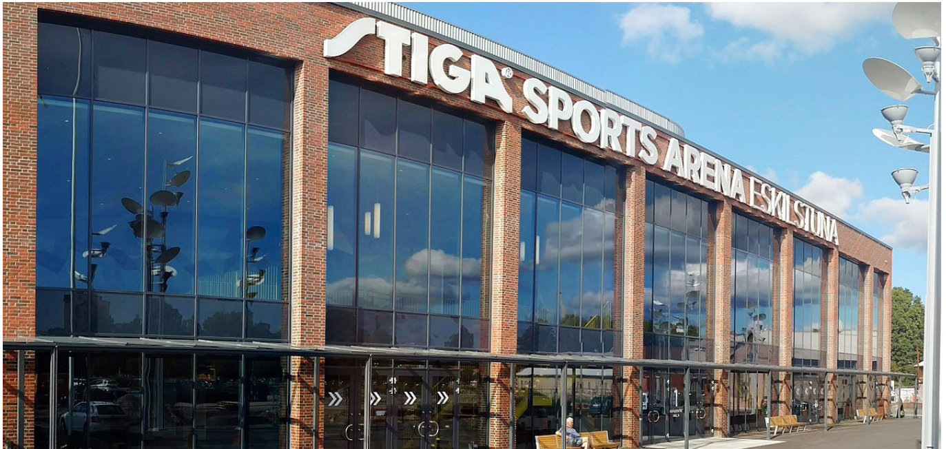
Figure 1 - STIGA Sports Arena Eskilstuna