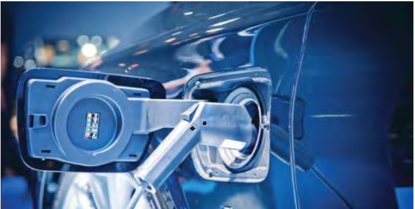
Niobium is being used to develop the next generation of lithium-ion battery for electric transportation. Early results demonstrate improvements to capacity, charging rate, performance life, safety and cost - thereby reducing barriers to mass adoption.

Scientific material benefits of niobium are associated with electrical conductivity, increased rate capability and ionic conductivity, faster charging, greater energy density and safety. The consumer expects these product benefits. Electrical conductivity, which controls the speed of transferring electricity to and from the battery, is a major barrier to improving LIBs. Adding small amounts of niobium can make cathodes nearly one billion times (1,000,000,000x) more conductive, thereby improving EV performance and generating faster delivery of electric current. (3)