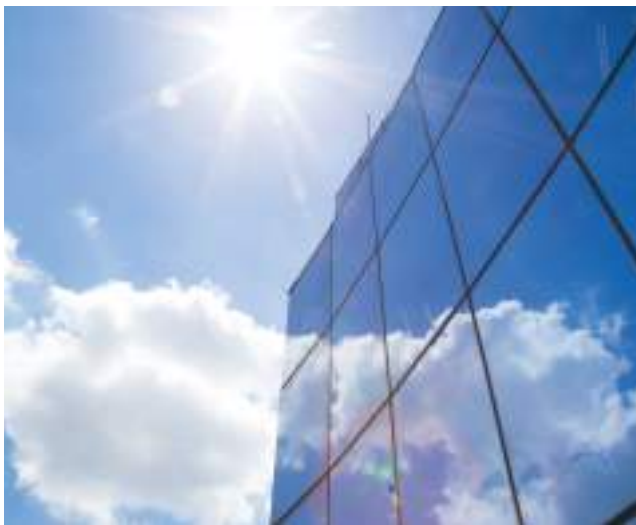
Niobium oxide is emerging as an additive in smart glass windows, which independently control the transmission of visible light and solar heat into a building, thereby reducing energy use and increasing occupant comfort.

strongly influenced the J-V hysteresis of the cells. Devices constructed with 50 nm Nb 2 O 5 have small or undetectable hysteresis, which become detectable and more prevalent with increased Nb 2 O 5 layer thickness. For the best device, energy conversion efficiency of up to 12%, short circuit currents of 17mA/cm 2 and fill factors of 74% were identified. These parameters are comparable to the best performance of similar devices in which the compact layer is TiO 2 . In addition, the use of Nb 2 O 5 improved the stability of solar cells under illumination. These improvements are attributed to a more efficient extraction of photogenerated electrons in the perovskite layer.