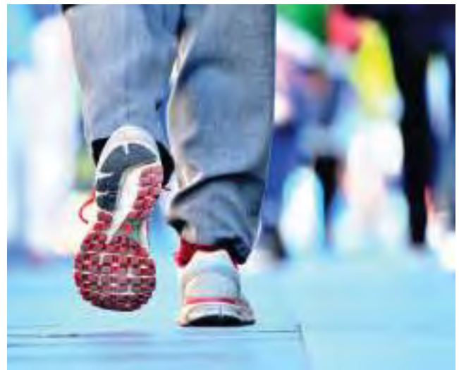
With piezoelectric structures located on the ground, the act of walking can produce electricity. Lead oxide based ferroelectrics are the most widely used materials for piezoelectric actuators, sensors and transducers due to their excellent piezoelectric properties. Considering lead toxicity, there is interest in using niobium as a replacement in piezoelectric applications for more widespread use.

The definition of piezoelectricity is an electric polarization in a substance (especially certain crystals), resulting from the application of mechanical stress. For example, people walking on the floor could generate piezoelectric energy created by